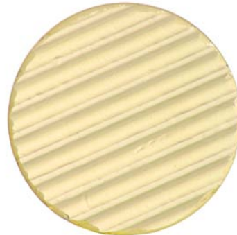
1072 / 1082 light amber spread insert