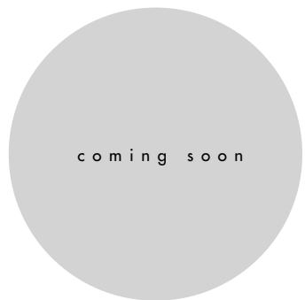
1061 / 1066 waffle insert