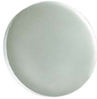
1021 / 1026 frosted insert