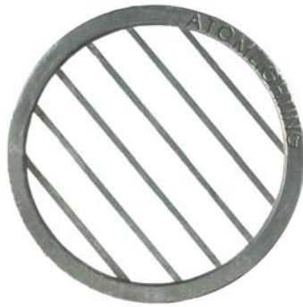
1011 / 1016 glare reduction insert