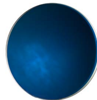
1091 / 1096 dichroic insert