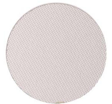
1051 / 1056 soft focus insert