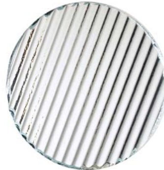
1031 / 1036 linear spread insert