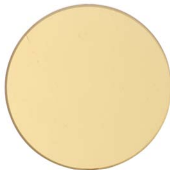
1071 / 1081 light amber insert