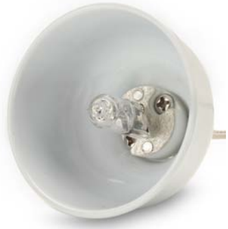
1001 / 1006 soft glow insert